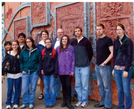
ISS students visit a wall related to 'The Troubles' during a visit to Belfast for the module 'International Relations'.

In recent years Stirling's historical importance, together with its innovative development, has been recognised by Her Majesty Queen Elizabeth II who marked her Golden Jubilee on the throne by officially declaring