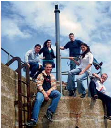
ISS students walking the pier on ISS trip to St Andrews

In addition in summer 2014 we are also expecting to offer new modules in Scottish literature, British journalism and the psychology of art.